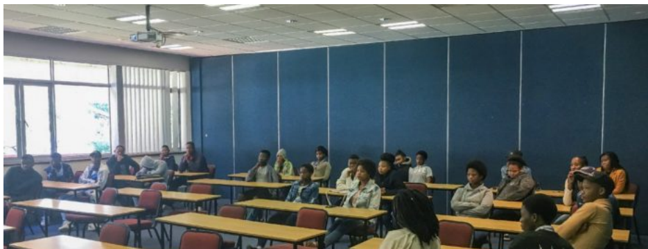
Inkululeko learners paying complete attention to the speaker at the leadership day in Eden Grove.

YOU ARE AT: Home » EDUCATION » Education OUR TOWN » Rhodes supports Inkululeko leadership training